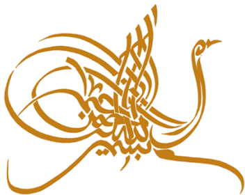
The phrase Bismillah by Hassan Musa

The Arabic script is a very unique and magnificent form of art. Few other languages have ventured to take their calligraphy to this extent, to the point where it becomes art in its own right.